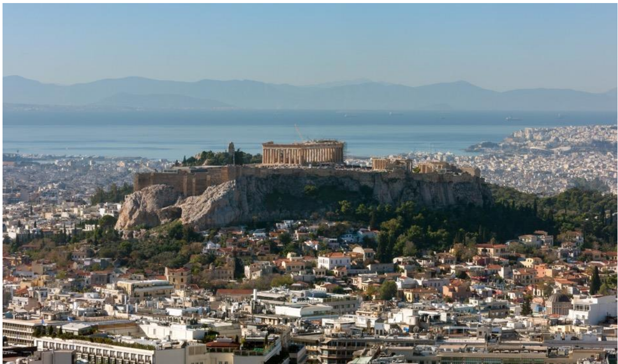
View of the Athenian Acropolis from Lykabettos

Athens is the capital and the largest city of Greece. It is one of the oldest cities in the world with a recorded history of over 3400 years, while its earliest human presence beginning between the 11th and 7th millennia BC. The city was named after Athena, the ancient Greek goddess of wisdom.