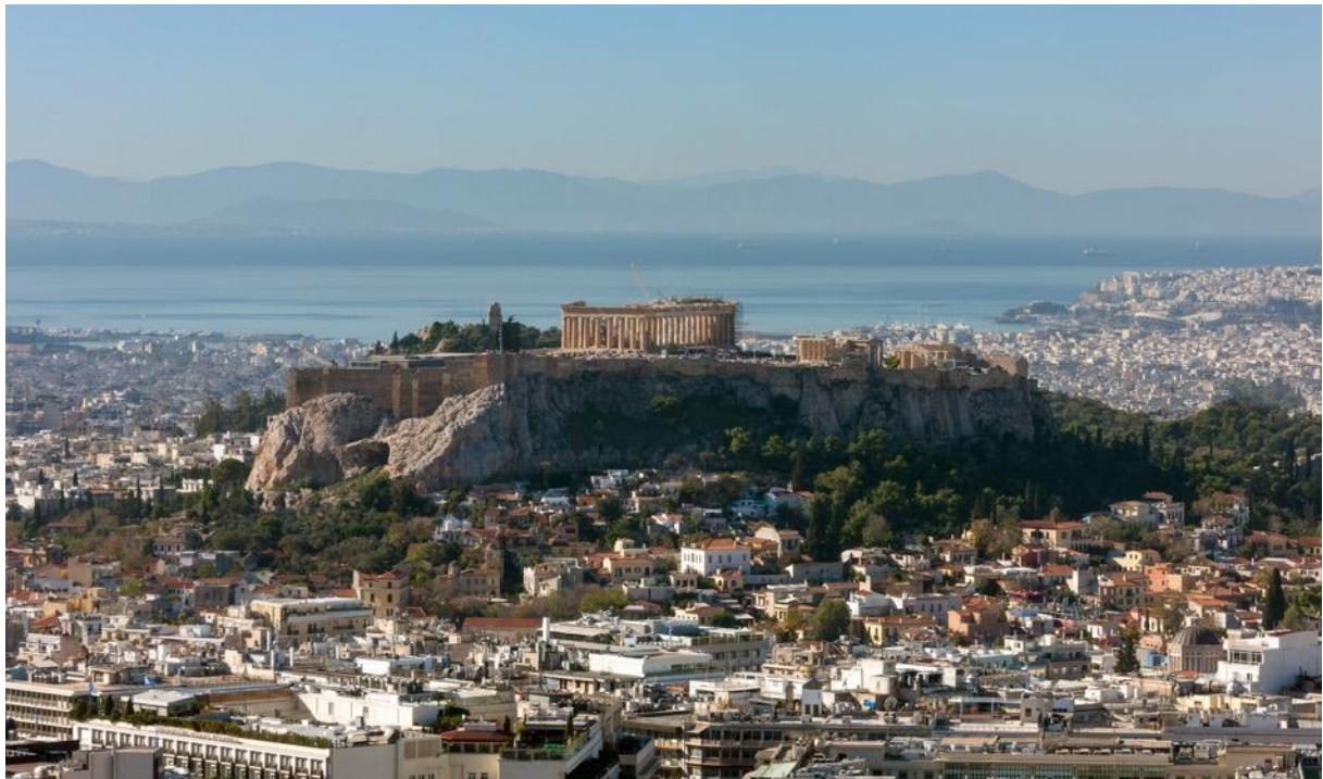
View of the Athenian Acropolis from Lykabettos

Athens is the capital and the largest city of Greece. It is one of the oldest cities in the world with a recorded history of over 3400 years, while its earliest human presence beginning between the 11th and 7th millennia BC. The city was named after Athena, the ancient Greek goddess of wisdom.