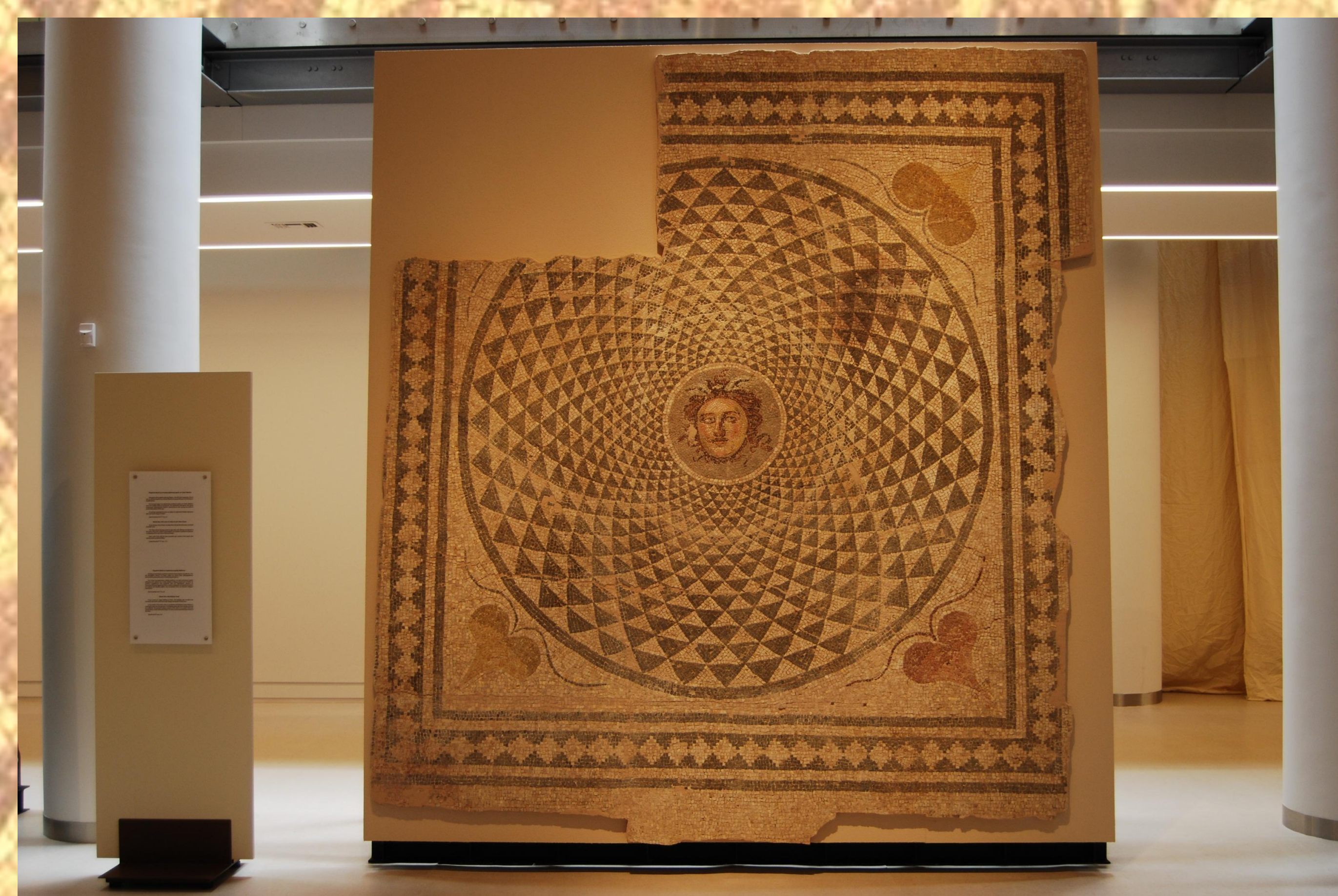
'Medusa Mosaic' on display