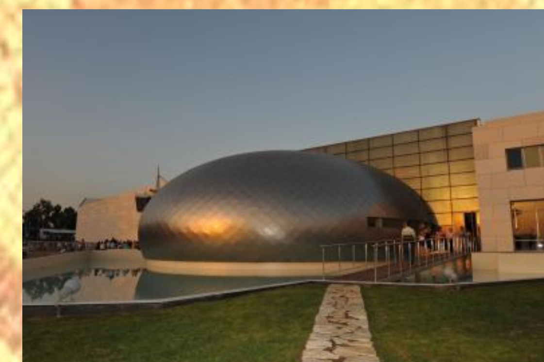
New Archaeological Museum of Patras