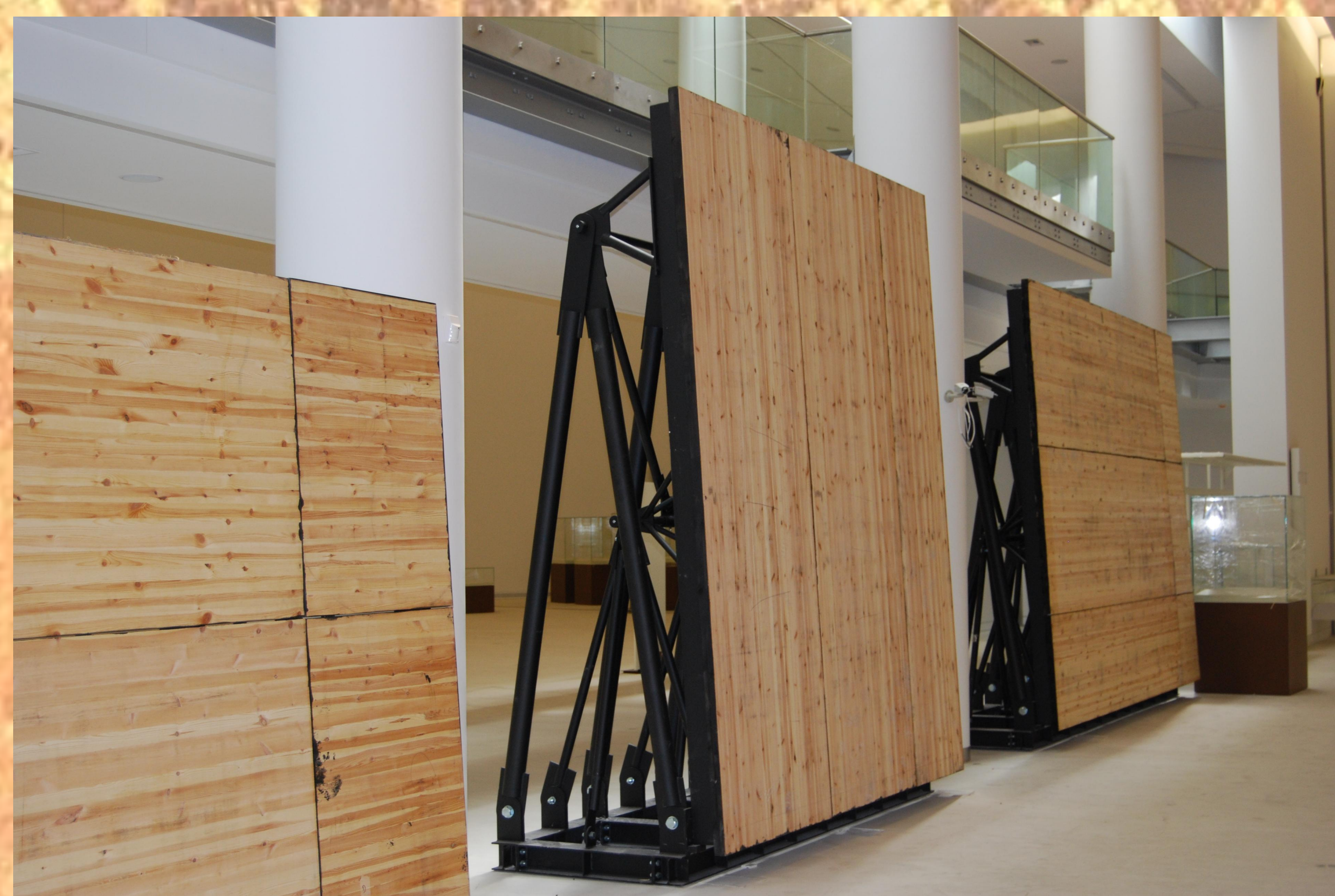
'Medusa Mosaic' base