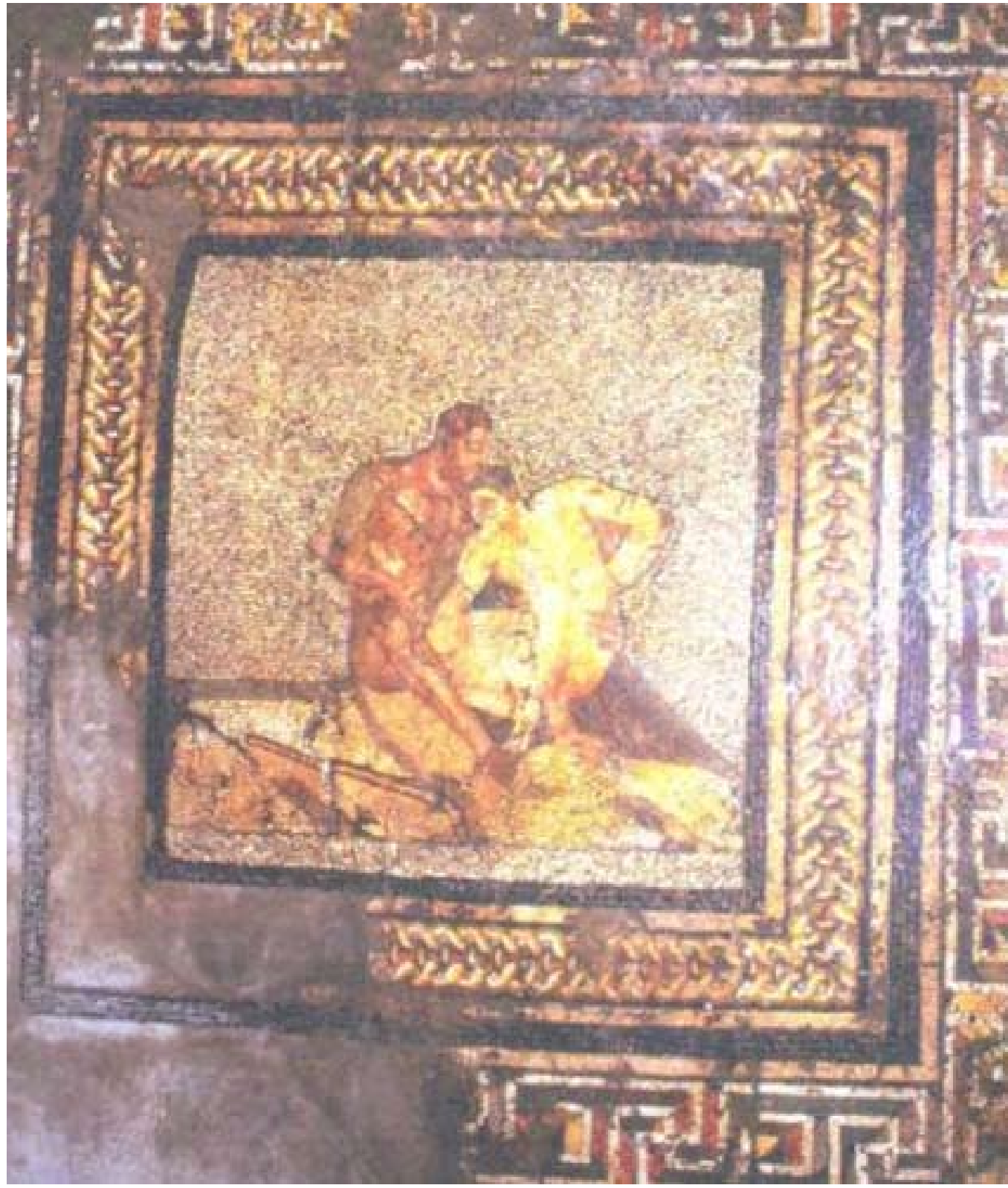
Photo 1 Register Number : No. 21738, Date : Discovered on 1923 at Tell Timim – Dakahleya City, Dimensions: 196 *196 cm Description: the main scene in the middle emblema on opus vermiculatum represent satyr and its border composed of meander perspective. Its composed from nature of tessela : terracotta , faience and stones and size of it range from 2- 10 mm.