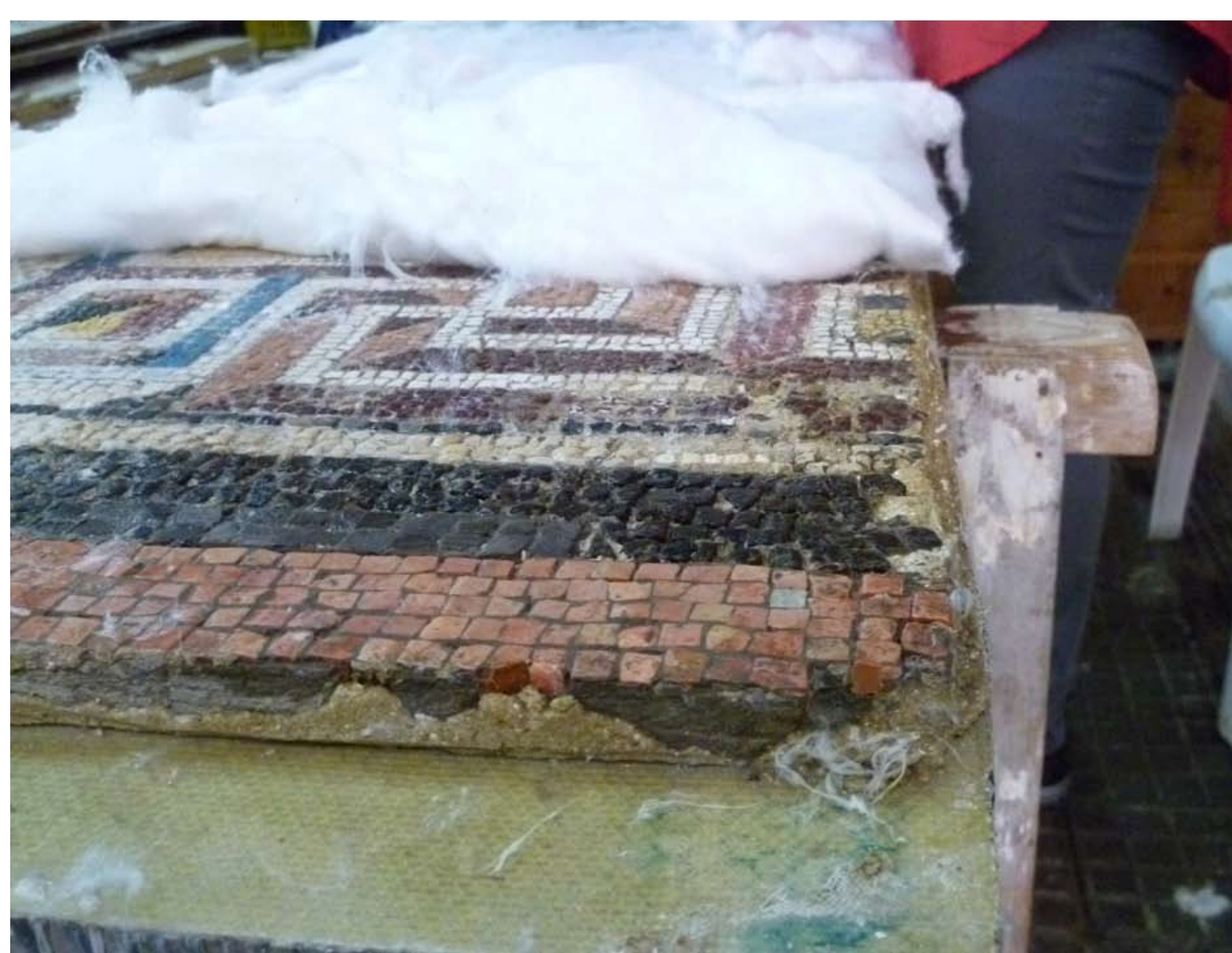
Photo 7 it shows the previous intervention under the tesserae