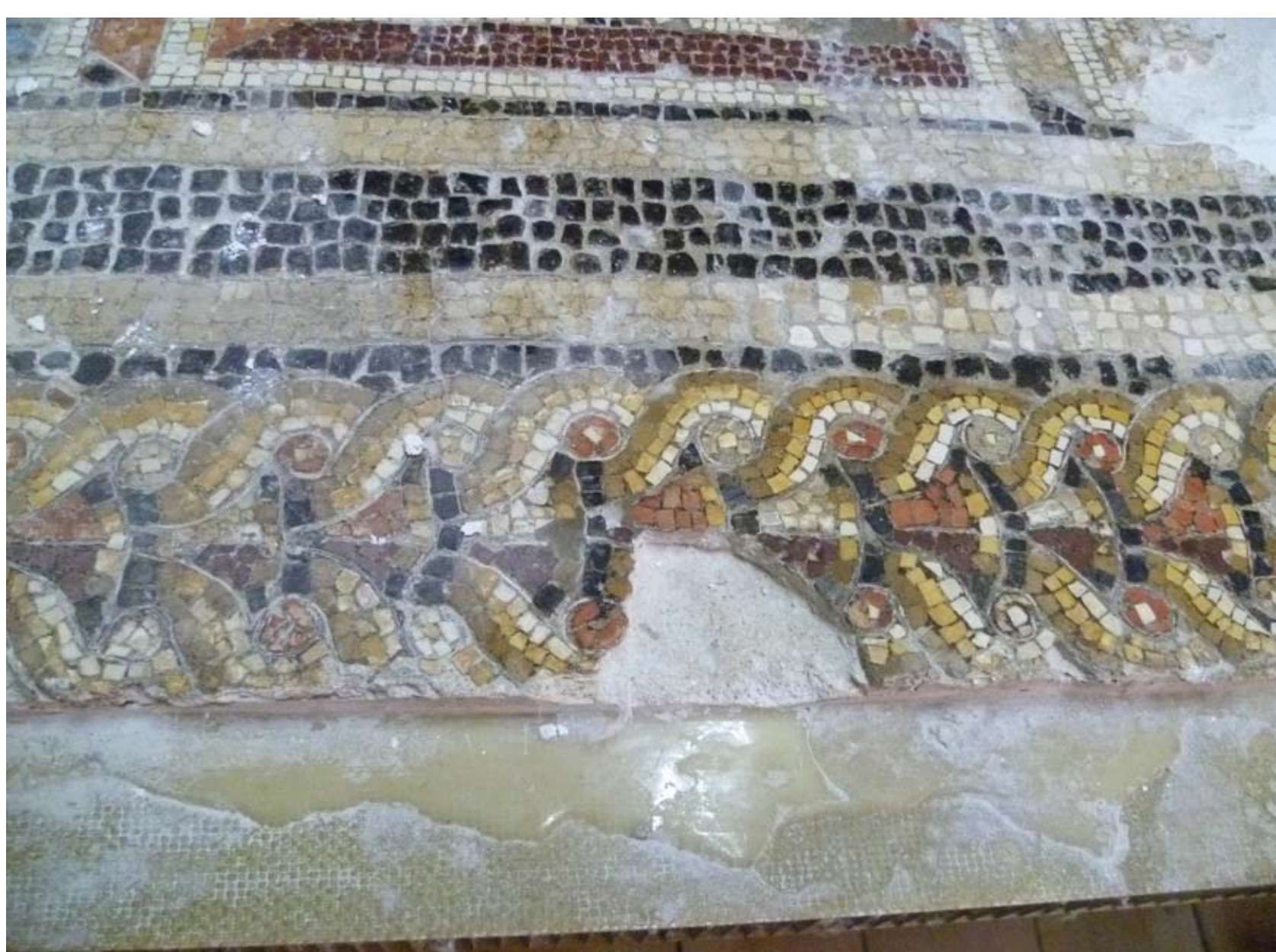
Photo 9 It shows the mosaic piece fixed with the Honey comb