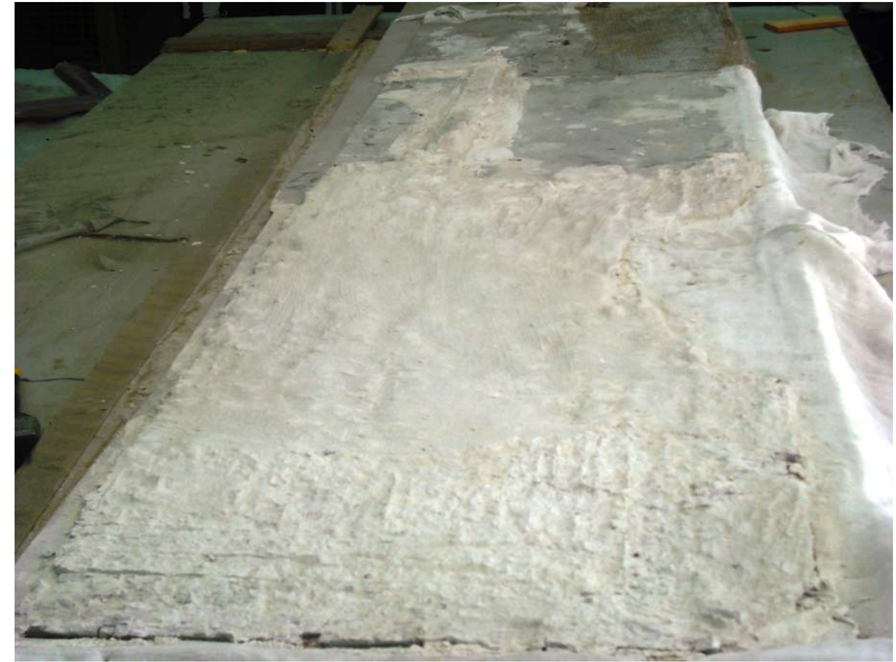
Photo 4 It shows the piece from the back side after removing the intervention.