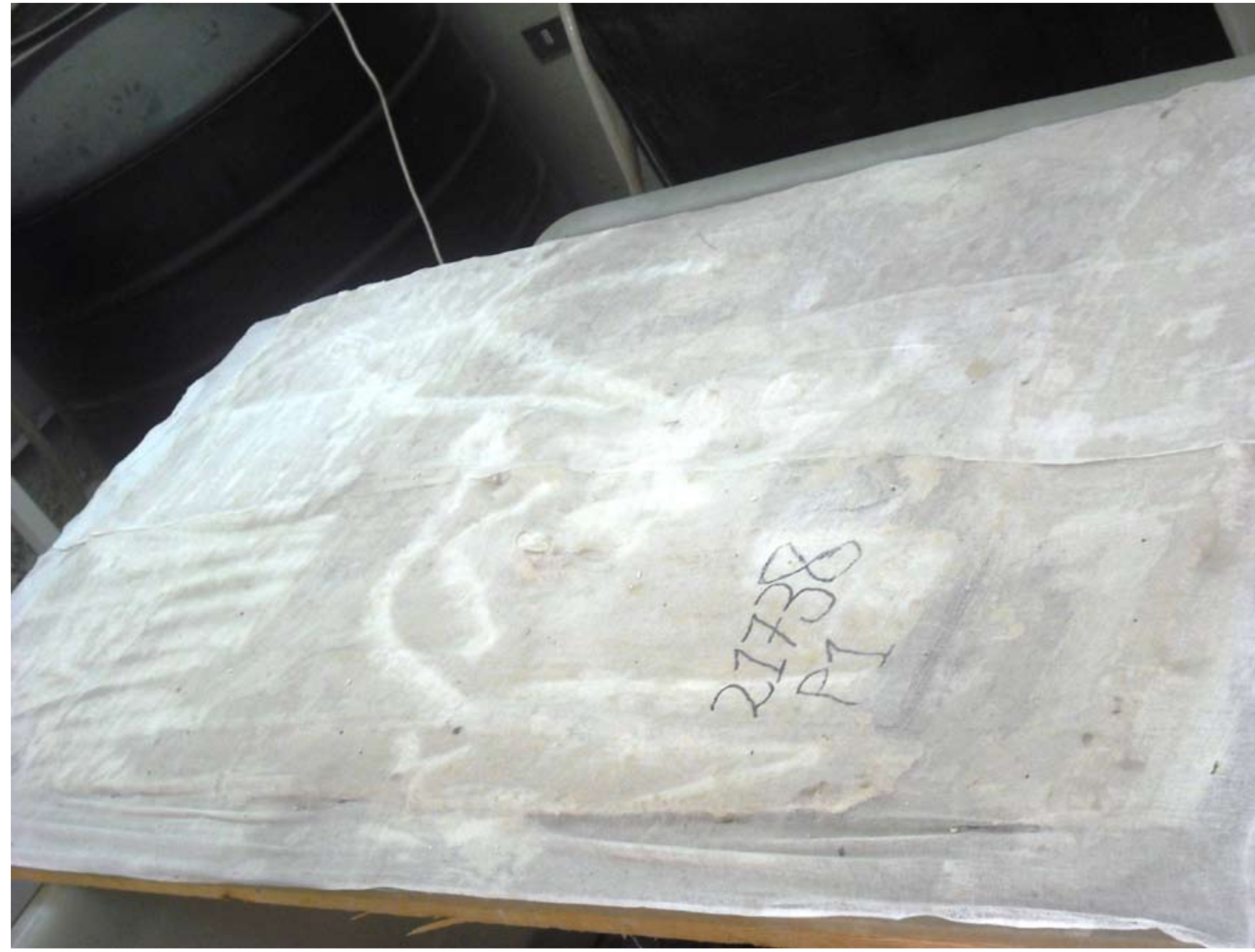
Photo 2 This photo shows one of the three pieces, covered by gauze on the surface of the mosaic