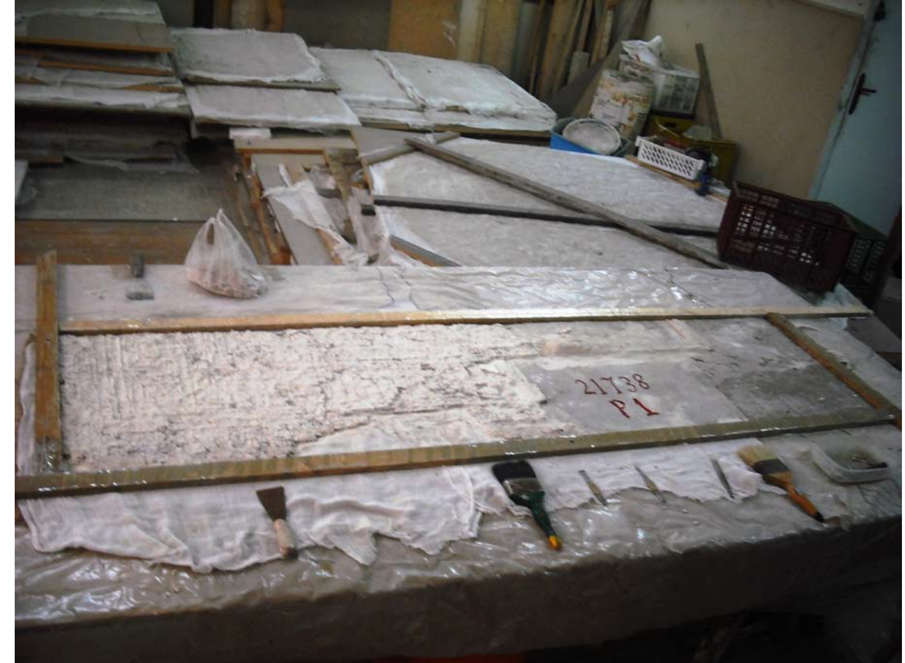
Photo 5 It shows the preparation for applying the new mortar