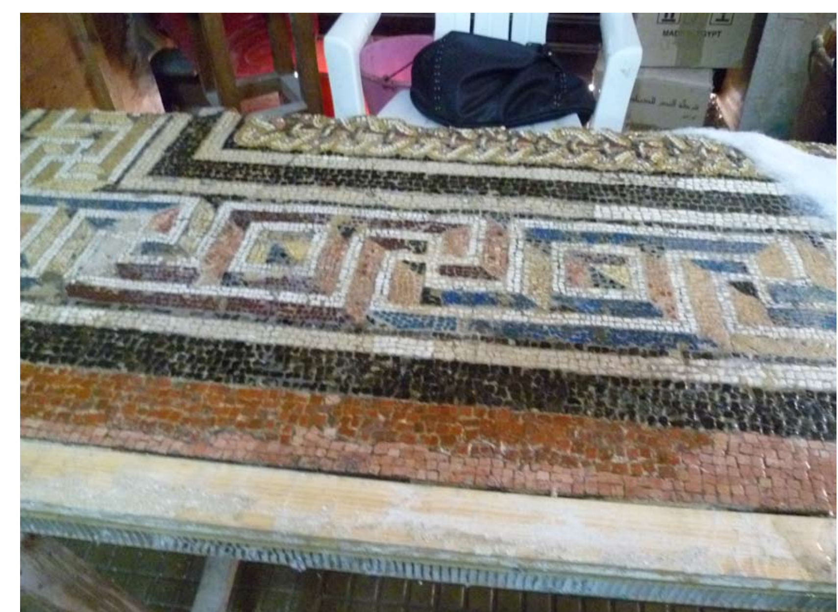
Photo 11 we are now working in this step to finilize it