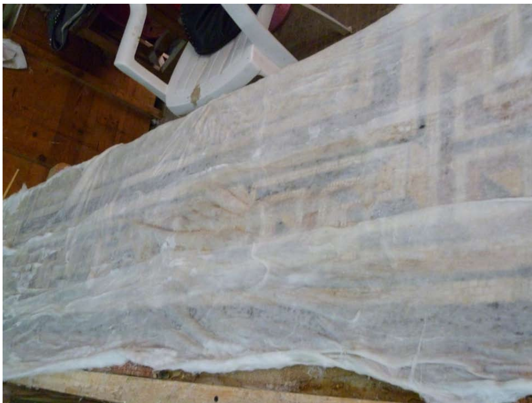
Photo 6 it shows cleaning the surface and removing the gauze