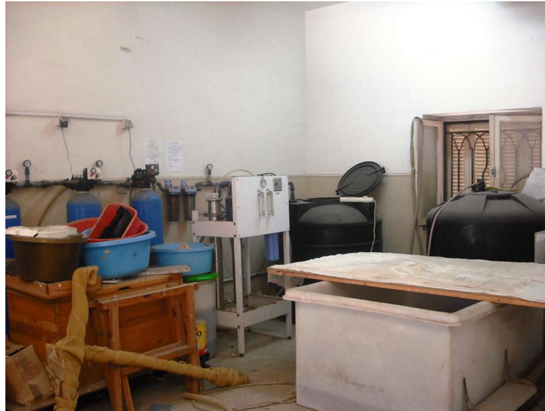
Photo 3 One of the three divided pieces in the restoration process